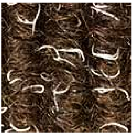
Brown no. 485