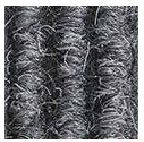
Light grey no. 220