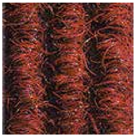
Red no. 305